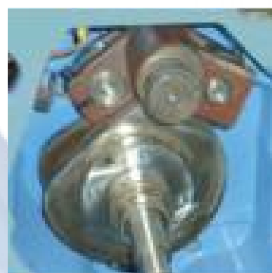
Cam Weft Battening