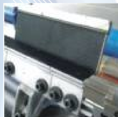
No Hook Guiding