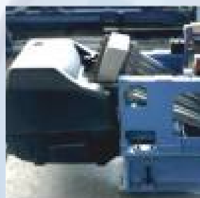
High Speed Electronic Dobby