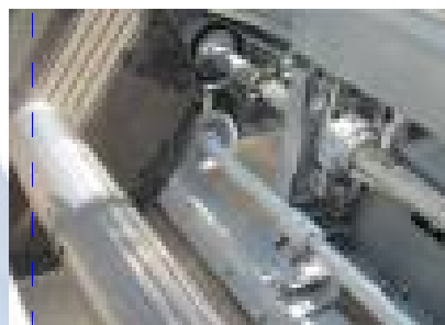
Warp beam flange diameter: \phi 600mm, \phi 700mm, \phi 800mm (Optional)