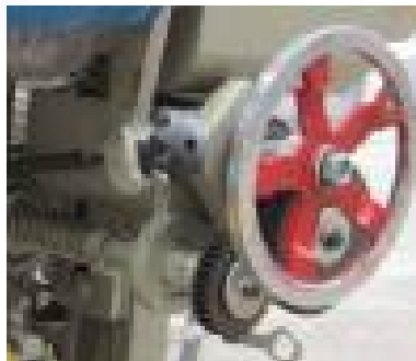
Mechanical continuous take up

This model of rapier is specially used for wider width looms.