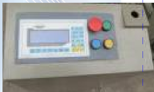
Electronic circuit control.