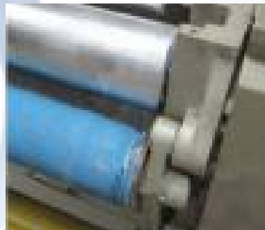
Three rolls system