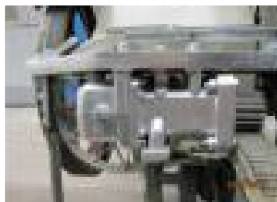
Strengthen type rapier transmission box