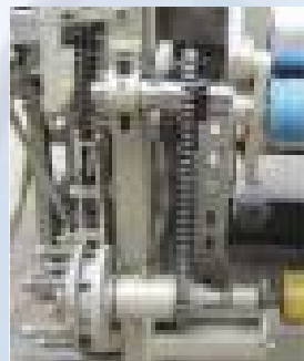
Friction clutch rolling device, which can adjust the tension