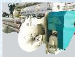
800mm M.S. High Beam