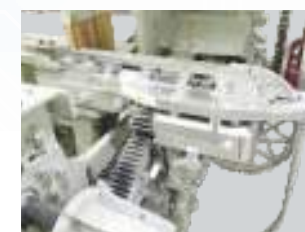
High Speed Gear Box