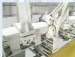
Bottom Main Shaft With Bearing