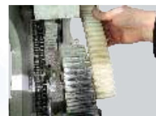
Wider nylon half gear