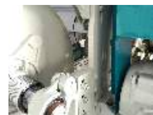
Steel cutting side wall