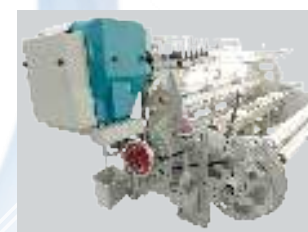
Back roller with new tension device