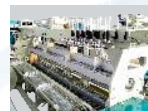
Small Bobbin Leno stand