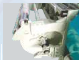
Adjustable Back Roller Base