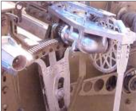
Four connecting rod weft insertion mechanism.