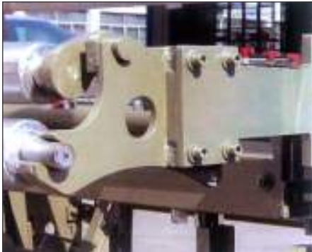
Retractable back rest