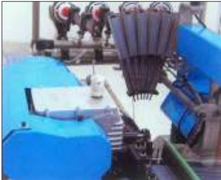
Electronic V type color selector and tuck in device (optional)