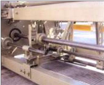
Strong bottom support